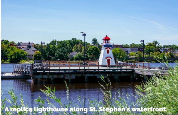
A replica lighthouse along St. Stephen’s waterfront

All gifts of $1,000 or more will be recognized in St. Stephen once the project is completed.