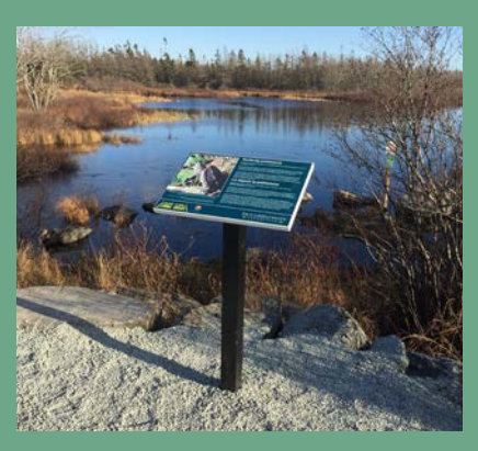
Above: New interpretive signage along the Shearwater Flyer Trail, NS

extra funding to Trail groups who need to use translation services for French, English and other languages.